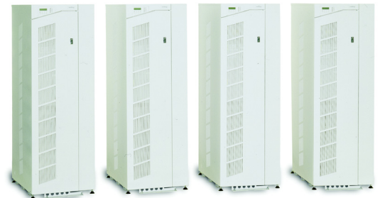
HotSync™ provides scalable power protection up to 320 (4x80) kVA

Furthermore, with the Hot Sync™ parallel load sharing technology, the absolute reliability of the UPS system can be increased by nearly 100%. The Hot Sync™ is designed for parallel redundant N+1 systems to satisfy 7/24h applications. This unique feature has the added advantage of erasing the single point of failure logic within the traditional load sharing systems, this is due to the ability of Hot Sync™ to synchronise and support the critical load independently of other UPS modules.